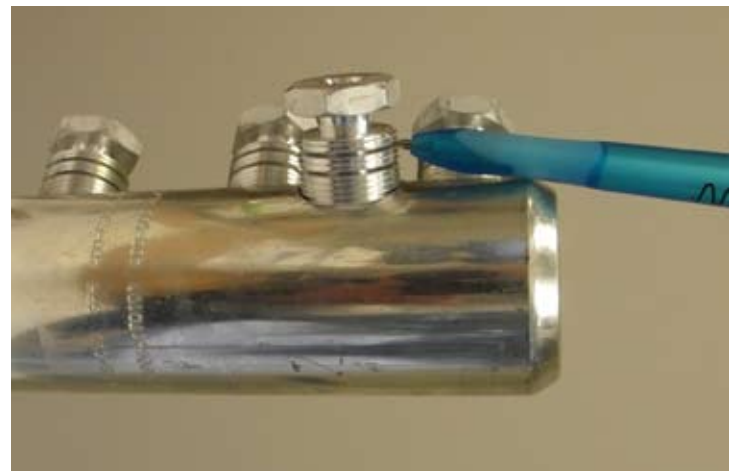
Above photograph clearly shows the Third Generation development in the C and M range connectors using the "multi shear off bolt technology" reducing the excess length of the connector bolt once installed.

It is physically intuitive that small cross sections should be connected with lower forces than larger ones. Exposing small conductors to high contact forces causes inevitable partial cross section reduction.